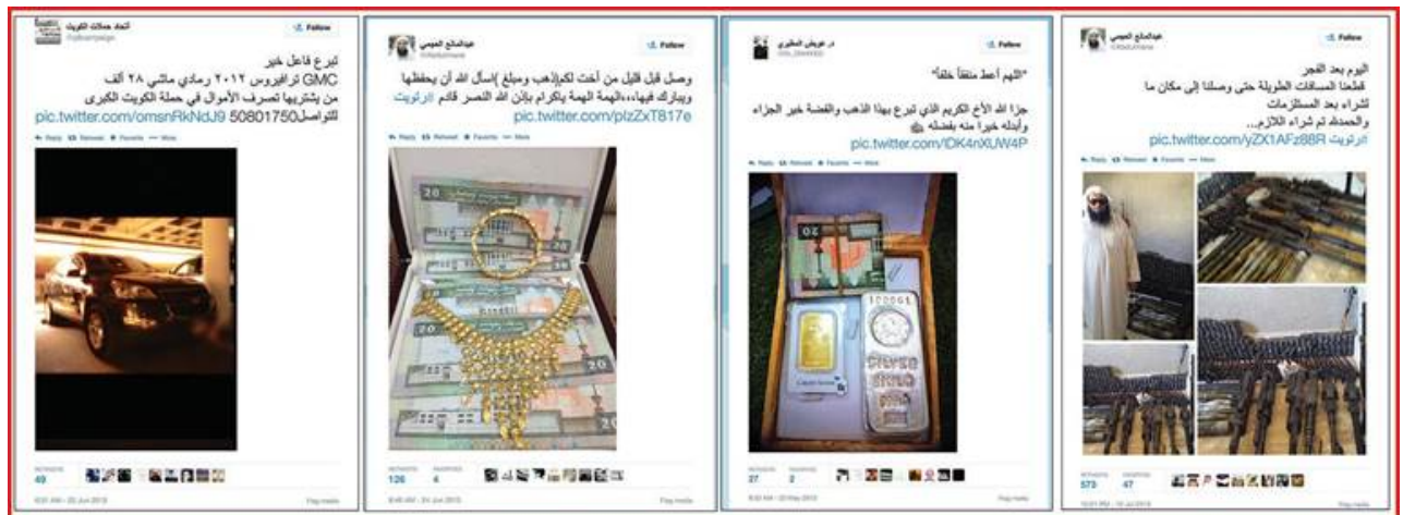
Donations to ISIS Publicized on Twitter

29. In its other Twitter fundraising campaigns, ISIS has posted photographs of cash, gold bars and luxury cars that it received from donors, as well as weapons purchased with the proceeds.