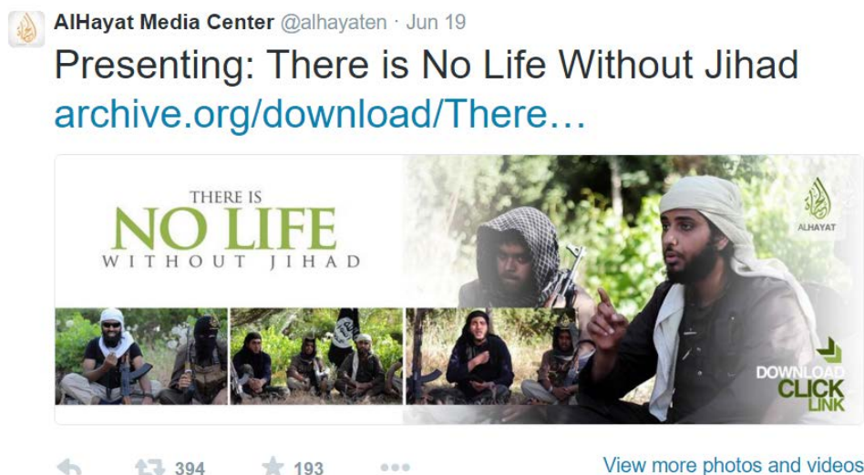
10 11 12 13 14 15 16 17 Tweet by Al-Hayat Media Center Account @alhayaten 18 Promoting an ISIS Recruitment Video

6 4. Likewise, Al-Hayat Media Center, ISIS's official public relations group, maintained 7 at least a half dozen accounts, emphasizing the recruitment of Westerners. As of June 2014, Al- 8 Hayat had nearly 20,000 followers.