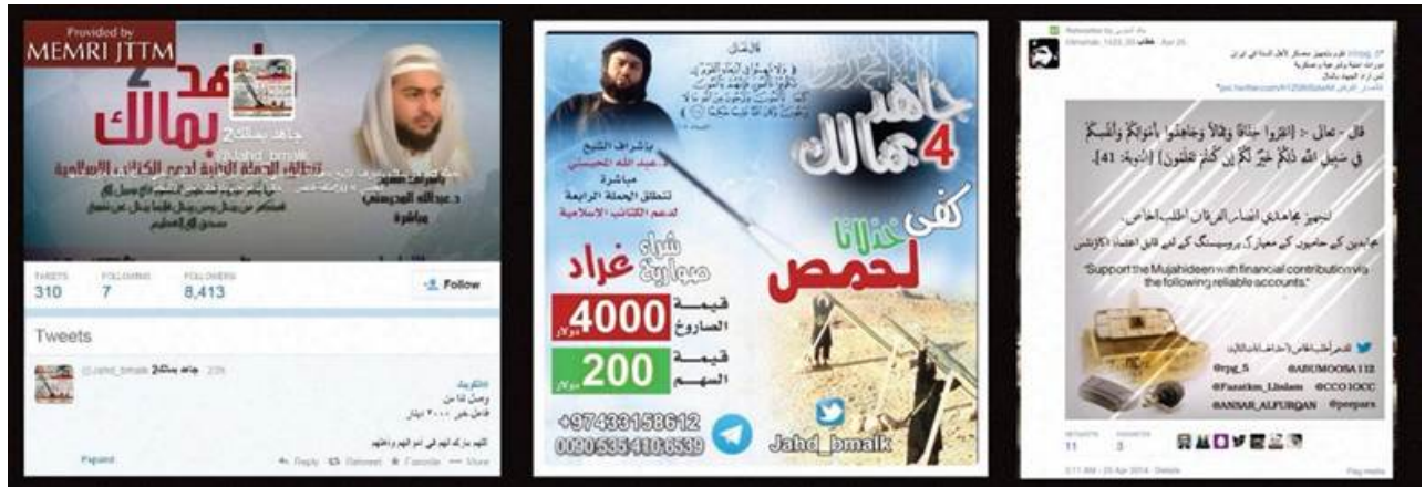
Fundraising Images from Twitter Accounts on ISIS

28. A similar Twitter campaign in the spring of 2014 asked followers to “support the Mujahideen with financial contribution via the following reliable accounts,” and provided contact information for how to make the requested donations.