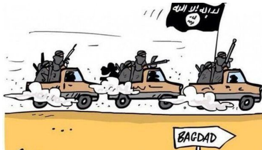
28 ISIS Propaganda Posted on @ISIS_Media_Hub

19 5. Another Twitter account, @ISIS_Media_Hub, had 8,954 followers as of September 20 2014.